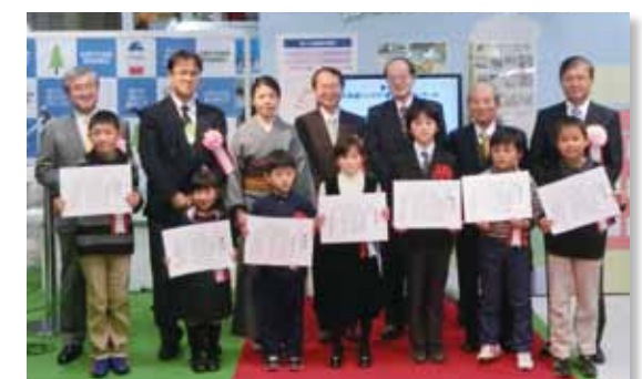
Awards ceremony held at Eco Products 2014