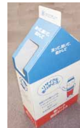
Half-size paper carton collection box

Please apply separately for this collection box to the Secretariat of COMCEI.