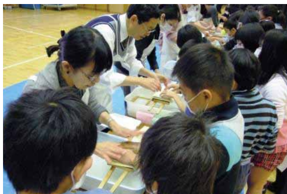
Handmade paper came out nicely! [Ichihara City Chiharadai Sakura Elementary School]

A paper carton recycling program was launched at this school in 2014 when the periods for integrated study were installed. The lesson was given to 74 fourth graders from two classes. Despite heavy snow, many parents attended the lesson along with the person in charge of waste reduction in the Cleaning Section of the Environment Department of Edogawa Ward. Using very cold water, the children carefully made original postcards out of handmade paper.