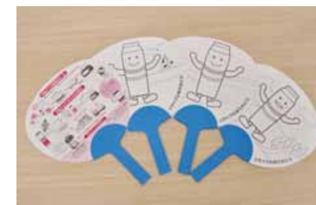
Newly created "Uchiwa"

We have employed a new design for the "Uchiwa" educational tool. The size is slightly larger than the previous one with an illustration for coloring on the front side. Three types of pictures, sea, mountains, and hills, are available. The rear side features milk carton collection rules and a description of the recycling flow. It is used in events such as recycling workshops and Eco-Life Fair.