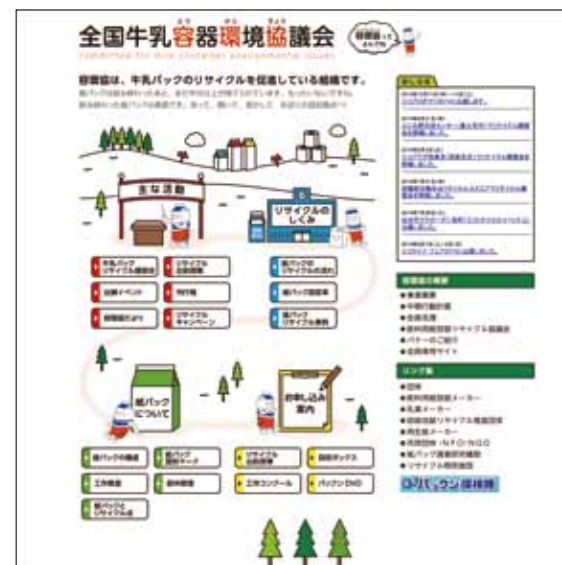
Renewed COMCEI website

Newly created half-size collection box and Uchiwa (paper fan)