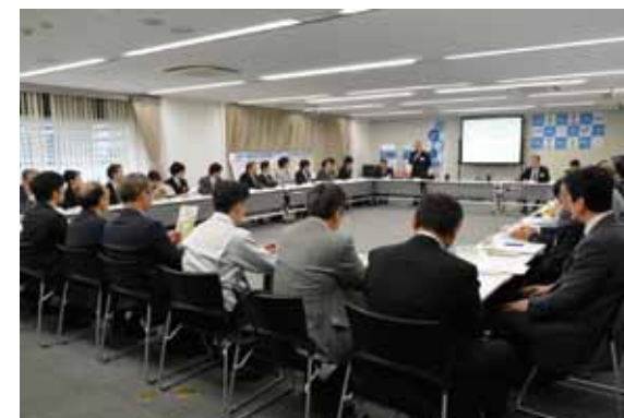
A regional conference in Kanagawa

problems related to resource collection, which makes it essential to work together with the public administration.