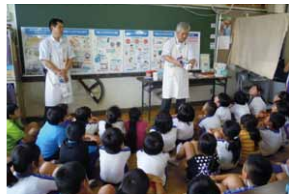
Lecture on paper carton recycling by "old poppa" (Noda City Futakawa Elementary School)

The rain in the morning due to typhoon No.16 had stopped when the lesson started for 108 fifth graders from four classes. While watching the demonstration of making postcards from handmade paper, one student asked us a good question: "Why do you come all the way from Tokyo for this onsite lesson?" We answered, "The collection rate of used paper cartons is still low, and that is why we are carrying out educational activities."