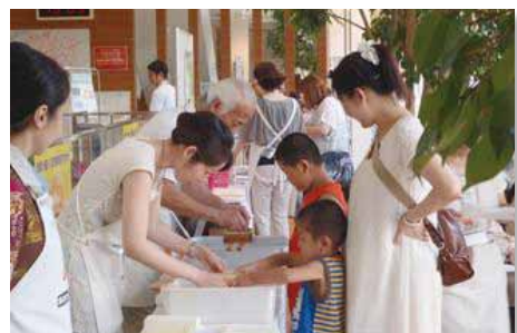
The corner of "Postcard making using handmade paper"

We held an eco-recycle event on July 26 and 27 in the community-based "LaLa garden Nagamachi" mass merchandise store in Sendai. This was the second time this event has been held in this city. Many visitors participated in the quizzes and the handmade paper making and newly added disassembly of milk cartons lessons. Our leaflet about postcard making using handmade paper was presented to those who wanted to make postcards from handmade paper at home.