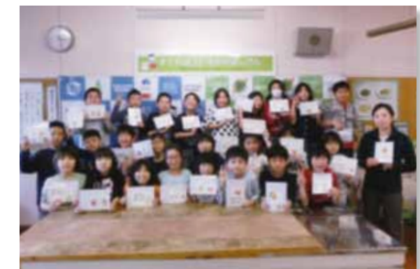
Here are our postcards made from handmade paper. (Mito City Akatsuka Elementary School)

On the day the onsite lesson for 51 fourth graders from two classes and two teachers was held, Japan was hit by a cold wave for the first time this winter. Students demonstrated a fairly high level of understanding about recycling as indicated by the number of correct answers they gave in the quizzes held during the lecture. During the on-site paper making lesson, students made postcards with reindeer and other Christmas designs. In the closing remarks, the children said boldly that "We will always continue recycling."