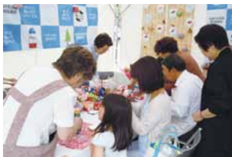
Creation of accessory pouches

COMCEI booth was thriving every day. We participated in one of the largest environmental exhibitions in Japan.