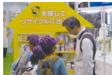
Explanation in the environmental panel rally

The largest environmental exhibition in Japan, "Eco Products Exhibitions", has been held every year since 1999, and 2014 marks the 16th time it has been held. COMCEI participated in this exhibition along with the Promotion Council of Milk Carton Recycle Product Mark. A total of 161,647 visitors attended the exhibition, and 1,607 people visited the COMCEI booth and took part in events. Various events were hosted in the booth including a "Environmental panel rally" that explained the rules of paper carton recycling, various educational materials were providing such as the "Story of Waste", and a workshop on "Disassembling milk cartons by hand". In addition to the above, visitors experienced postcard making using handmade paper, which was co-hosted by JAMRA. Through the various exhibitions and activities, we were able to share information to deepen understanding of paper carton recycling and ask for cooperation.