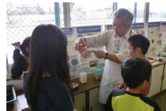
Fascinated by recycling of paper cartons! (Nogi-machi Tomonuma Elementary School)