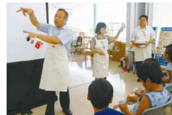
Disassembly of used milk carton by hand (Sagamihara City)