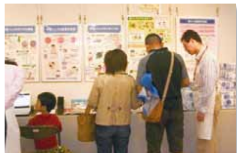
Try the panel quiz!

JAMRA and COMCEI participated in the "Environmental event for parents and children in spring break" by running a workshop. It was held on March 29 and 30, when cherry blossoms were in full bloom, at Art Spot Matsudo in the new annex of the Isetan Matsudo Store. In the two-day event, about 170 people participated in postcard making using handmade paper, and about 130 people took part in the panel quiz.