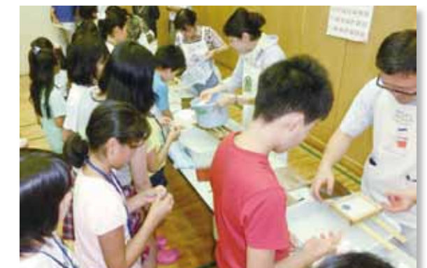
How did your original postcards made from handmade paper come out? (Fuji mi City)