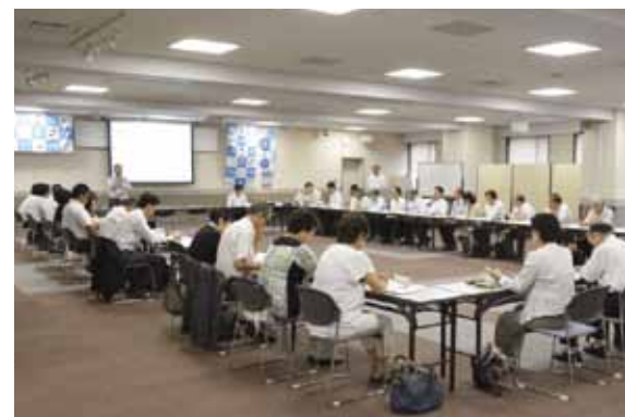
A regional conference in Tokatsu, Chiba